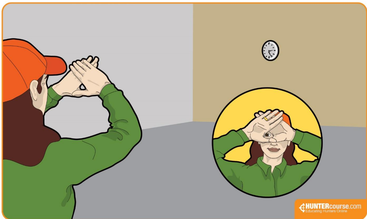
Figure used with permission: http://www2.huntercourse.com/minnesota/study?chapter=8&page=2